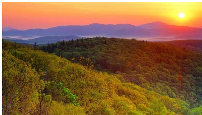
Beautiful Grandfather Mountain Sunset

Seasonal changes make each trip on the 469-mile Blue Ridge Parkway a new adventure. Meandering through a variety of landscapes, the scenic drive has lookout points, hiking trails and picnic sites along the way. This Asheville, NC hotel is four miles away.