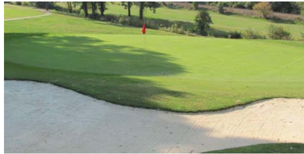
Play a round or two at the scenic 9 –hole course on site