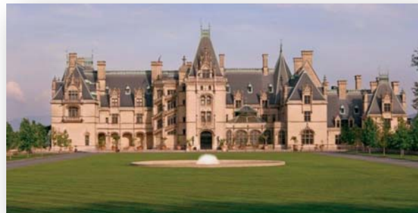
Or spend the day at Asheville’s most popular attraction—The Biltmore House!